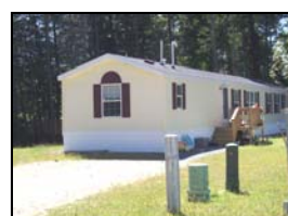
Two of the new units in Frances Court