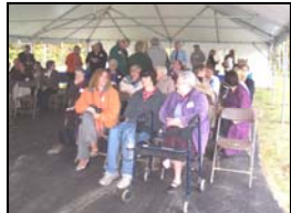
Land Trust residents, members and supporters gathered for ribbon cutting ceremony