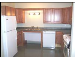
Pinecrest Unit Kitchen

LACLT competed statewide with for-profit and not-for-profit developers for funding for this $8 million dollar project. Funding came from a variety of sources. Predevelopment financing was provided by the Land Trust, NeighborWorks® America, NH Housing Finance Authority, and Rural Local Initiative Support Corporation. Permanent Financing was provided by Federal Home Loan Bank of Boston, the Land Trust, Meredith Village Savings Bank, NeighborWorks® America, NH Housing Finance Authority, Northern New England Housing Investment Fund, Town of Meredith Community Development Block Grant from the NH Community Development Finance Authority, and USDA Rural Development. Grants were provided by the Housing Assistance Council and the NH Electric Co-op. The Greater Meredith Program purchased the first 10 trees along Boynton Road