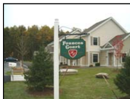
Frances Court Sign Overlooking Pinecrest