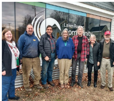
Save Our Gale School Committee (SOGS) and LRCD staff pose for a photo after SOGS officially signed the deed for the Gale School over to LRCD in December.

We continued working to complete the funding stack required to renovate this beloved school building. The first floor will house a childcare center operated by the Boys & Girls Club of Central and Northern New Hampshire. The second floor will be a new program center for Lakes Region Community Services.